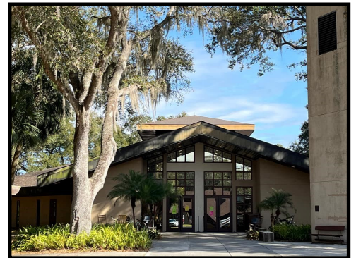
Warren Willis Auditorium

You may be wondering how this new location will compare to our old location. You will find it to be very similar. Women will be staying in hotel-style rooms, each with a single bed. We will hold our main gatherings and worship in this beautiful facility. There is even a prayer labyrinth and an outdoor space where we will have s'mores on Saturday evening.