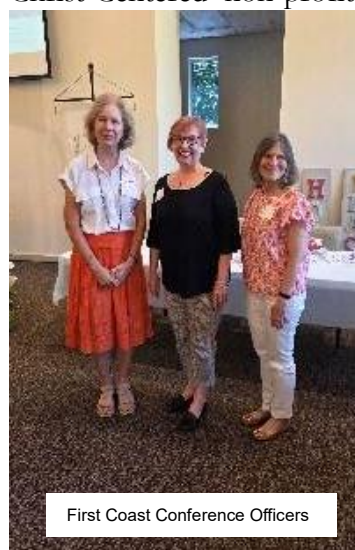
First Coast Conference Officers